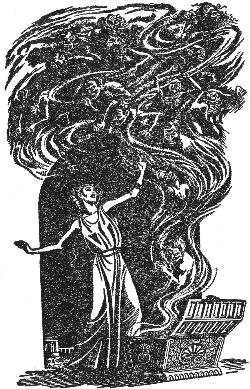
Pandora lifted the lid and out flew plagues and sorrows for mankind

These two stories of the creation,—the story of the five ages, and the story of Prometheus and Epimetheus,—different as they are, agree in one point. For a long time, certainly throughout the happy Golden Age, only men were upon the earth; there were no women. Zeus created these later, in his anger at Prometheus for caring so much for men. Prometheus had not only stolen fire for men; he had also arranged that they should get the best part of any animal sacrificed and the gods the worst. He cut up a great ox and wrapped the good eatable parts in the hide, disguising them further by piling entrails on top. Beside this heap he put an-